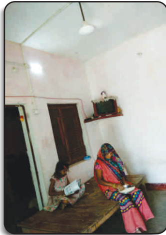
Rural households while doing their work

The Company consistently addressed Home Lighting Segment and successfully completed deployment of SPV LED Power Packs at more than 36000 BPL homes have been lighted fulfilling electricity needs of un-electrified villages and several Hamlets across the state of Rajasthan and in Uttar Pradesh.