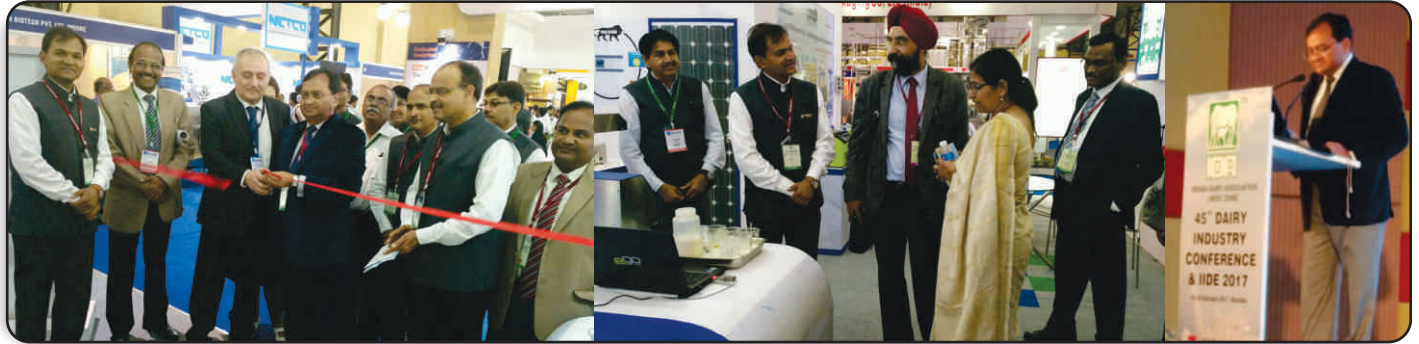
Inauguration of REIL stall during IDA