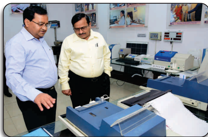
Joint Secretary, DHI and MD, REIL during the visit