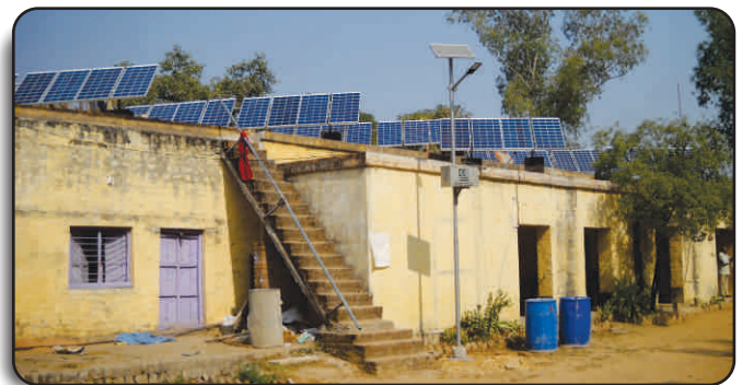
SPV Power Plants at Residential Hostel