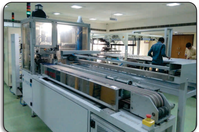
Automatic Stringer Machine installed at Factory premises

In line with market needs and "Make in India" initiative of Government of India and it's Green Energy Commitments, REIL has installed Automatic Stringer Machine with a capacity of processing 700 cells/hr to make solar string and this machine can process cut cells upto 40 mm.