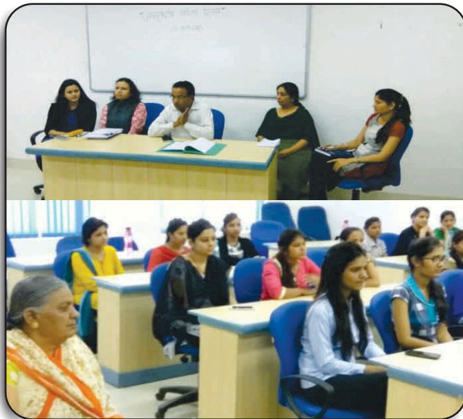
Discussions by Female Employees during International Women day

International Women's Day is a worldwide event that celebrates women's achievements – from the political to the social – while calling for gender equality. The women at REIL also celebrated the day and their achievements by having discussions over the key issues like Managing office and home all at once, Participations by them in-house and external activities, Leadership roles by women, Women welfare schemes and regarding their safety at workplace.