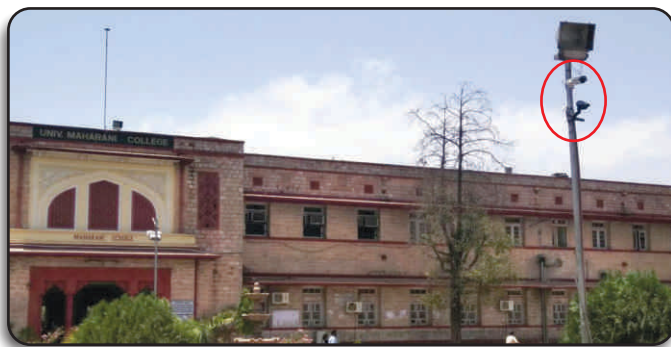
CCTV camera installed at Maharani College, Jaipur

For ensuring digital security in education sector, REIL deployed more than 3500 cameras in 195 exam centers across Rajasthan for Board of Secondary Education Rajasthan (BSER) along with provision for live monitoring at BSER Head office hence preventing suspicious activities/malpractices in the exam centers.