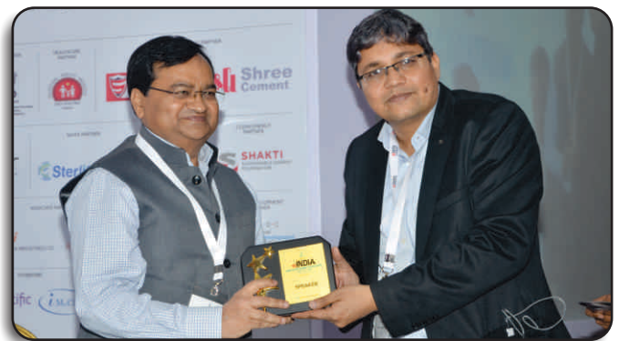
MD REIL at 12 th eIndia Innovation Summit

He emphasized the need to connect Industry, Institute and R&D through a dedicated chair at Industry and Institute level, while working in line with Make in India, Skill India and other government initiatives. This will enhance the grasping skills at initial level and produce quality workforce ready to be entrepreneurs and innovators.