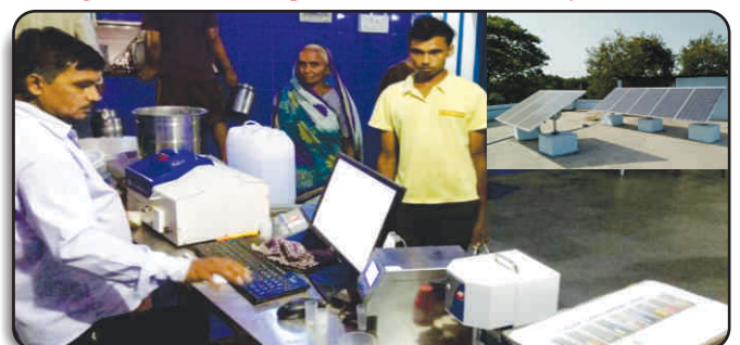
Rooftop Grid Interactive Hybrid Solar Power Plant-2kWp at work at Mujkuva, Anand