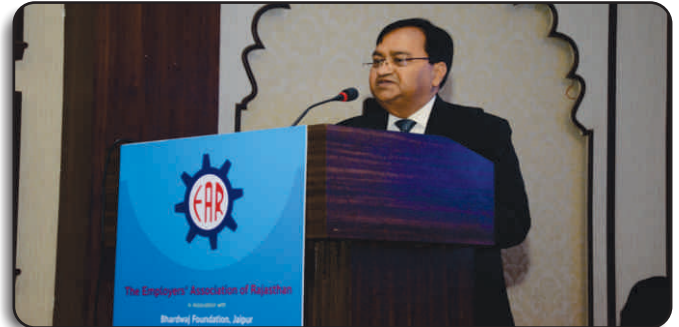
MD REIL sharing his views on Academia-Industry linkages

MD REIL being Vice president, EAR shared his views on Academia-Industry linkages while highlighting the needs and expectations of the Industry.