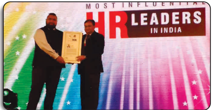
MD, REIL receiving "CEO with HR Orientation Award"