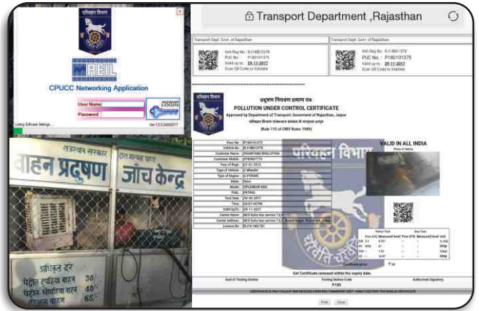
Online application at PUC Center, Jaipur

networking for Pollution Check Centers (PUC) in Jaipur by doing pilot for about 23400 vehicles, against the total order for networking of about 800 authorized PUCs across the state covering 50 Lac vehicles.