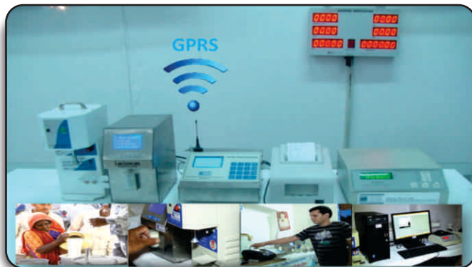
GPRS based DPMCU

In an initiative through whatsapp group-“ Mission March Smart Dairying ”, the Company has recently completed Go-Live Error Free Dairying through upgradation of 5000 Village based Milk Procurement Systems (DPMcUs) in Producer Companies of NDDb under National Dairy Plan in a record time of 25 days covering Rajasthan, Punjab, Andhra Pradesh and Gujarat. This would now facilitate live, centralized and instant milk collection through these upgraded versions.