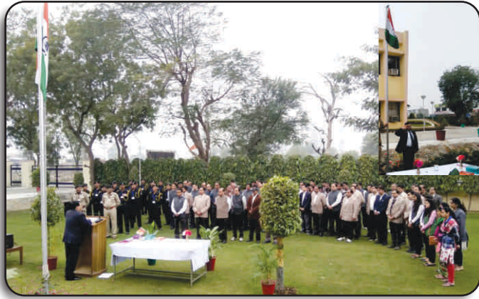
MD addressing the REIL team on Republic Day

On the occasion of Republic day, National flag was hoisted by the Managing Director. Employees along-with their family members actively participated in the flag hoisting ceremony.