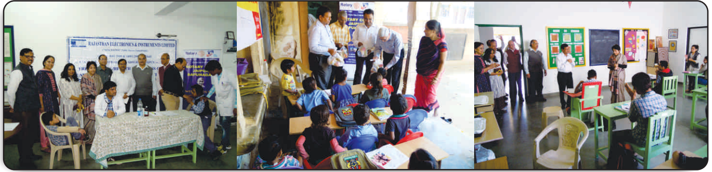
Glimpse of Medical camps at Government schools and NGO, under CSR activity of REIL