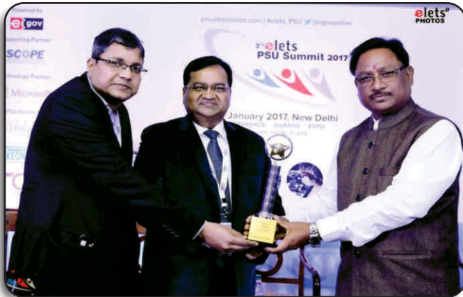
MD, REIL receiving “PSU Leadership Award”

The Company was presented with “PSU Leadership Award” by Elets Technomedia Pvt. Ltd. at New Delhi on 31 st January, 2017.