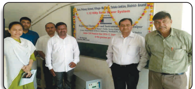
Inauguration of 1.12 kWp Solar Power Plant at Mujkuva, Anand