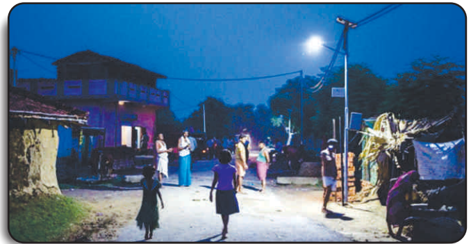
SPV based LED Street Lights

More than 5000 nos. SPV SLS have been deployed in the FY 2016-17 under PSU CSR of the customer.