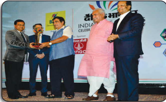
MD REIL receiving "India Pride Award" from Shri Nitin Gadkari, Hon'ble Minister, Ministry of Shipping, Road Transport and Highways, Government of India in the gracious presence of Shri Monaj Sinha, Hon'ble Minister of State, Ministry of Railways on 27 th March, 2017.

The Company has been awarded “ India Pride Award ” by Dainik Bhaskar Group, in Agriculture and other category for its contribution in Agro Dairy Electronics through development and deployment of equipment/solutions for qualitative and quantitative analyses of milk including the system for detection of hazardous adulterants in milk.