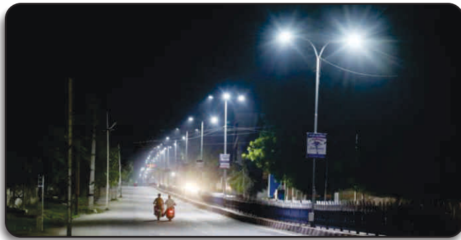
LED Street Lights installed at Udaipur