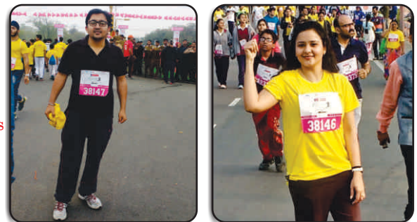
Participants during Jaipur Marathon 2017