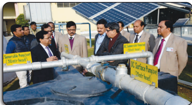
Secretary, MNRE, MD RRECL, Advisor MNRE being briefed by MD, REIL about the REIL products

Secretary, MNRE observed the Electronic Instruments Manufacturing facilities, Automatic Solar Module Manufacturing Line, Remotely Monitored SPV Water Pumps and Solar Rooftop Project in the REIL premises.